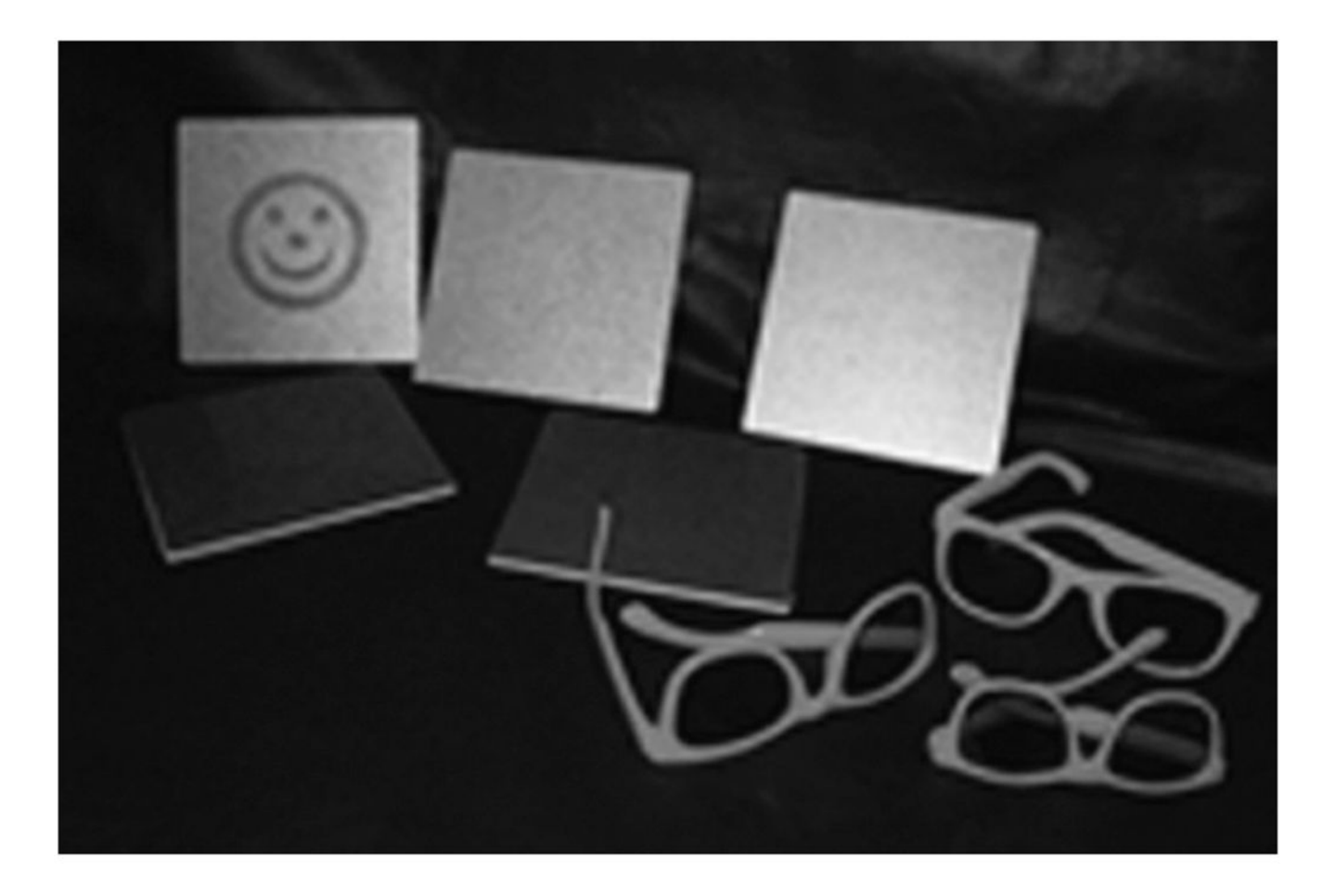
FIGURE 1. Photo of Stereo Smile II Test.