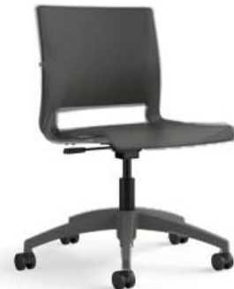
Bio Safety Cabinets/ Fume Hoods