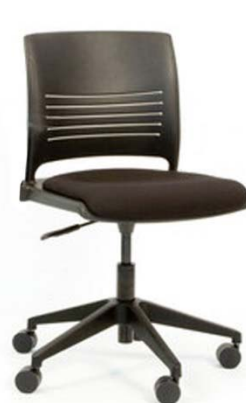
Bio Safety Cabinets/ Fume Hoods