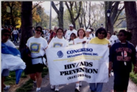
The Congreso Team at the AIDS Walk