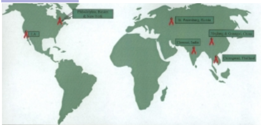
HPTN Site Map