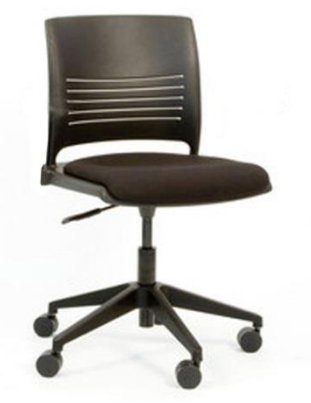
Bio Safety Cabinets/ Fume Hoods