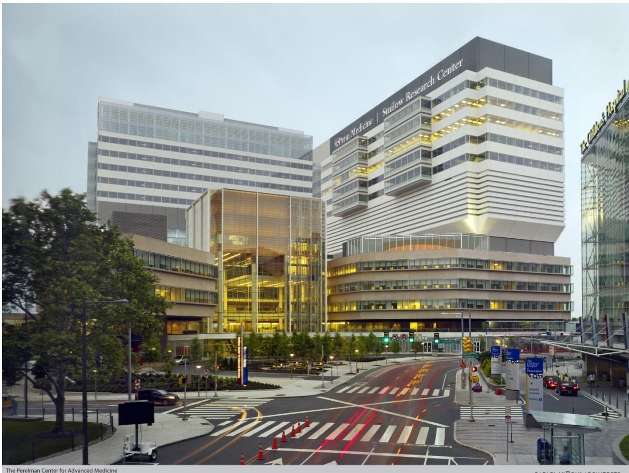
The Perelman Center for Advanced Medicine