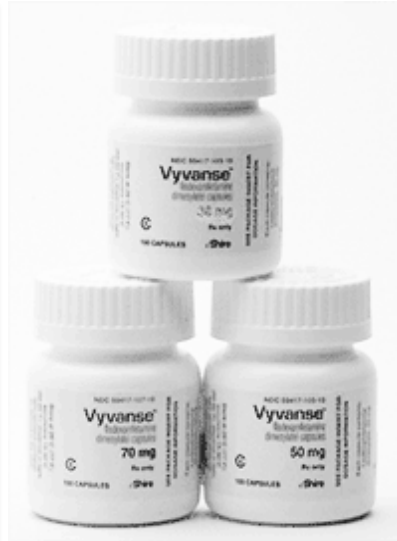
Study Drug, Vyvanse

In our Center's current double-blind, placebo-controlled, cross-over study, menopausal